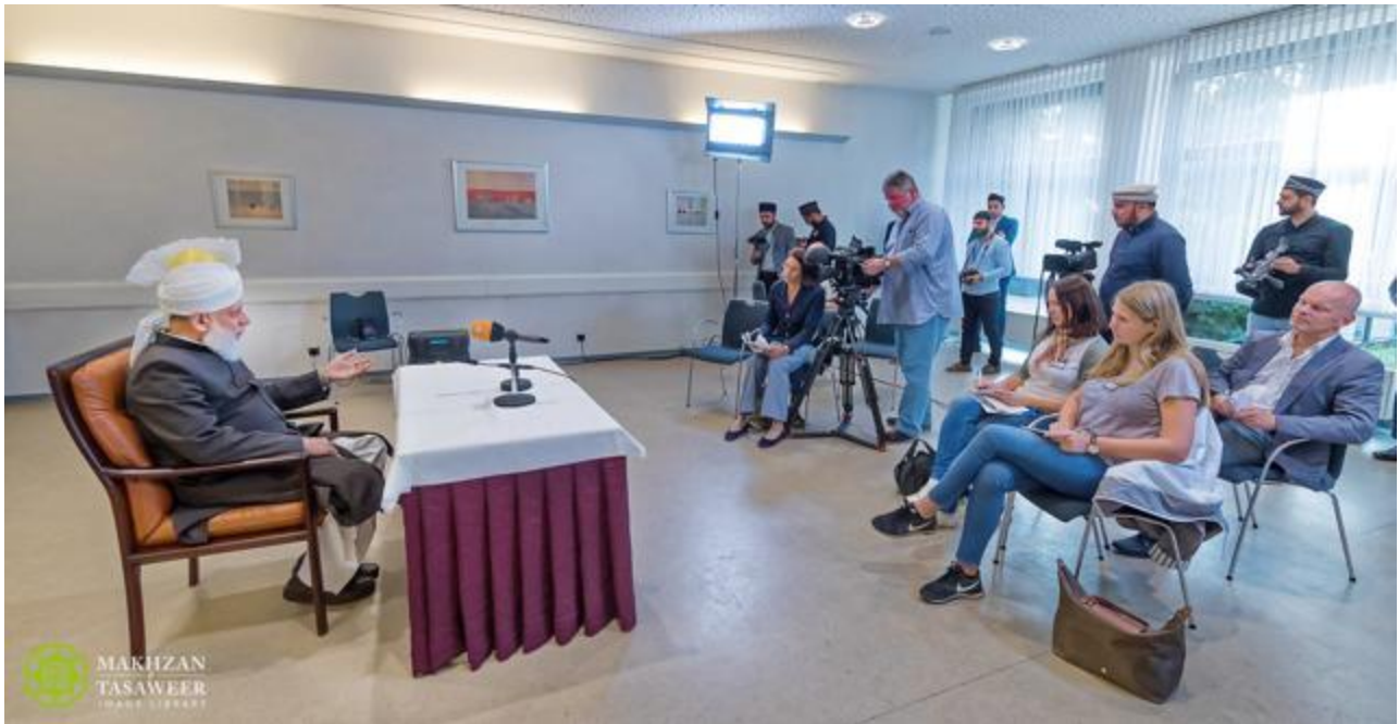
Hazrat Mirza Masroor Ahmad continued:

integration requires that all people live peacefully with one another, manifest a spirit of love and kindness and, whether male or female, use all their faculties and capabilities to serve their nation and to help it advance. Hence, our Ahmadi Muslim women are working as doctors, nurses and in many other fields and are contributing to society in the very best fashion.”