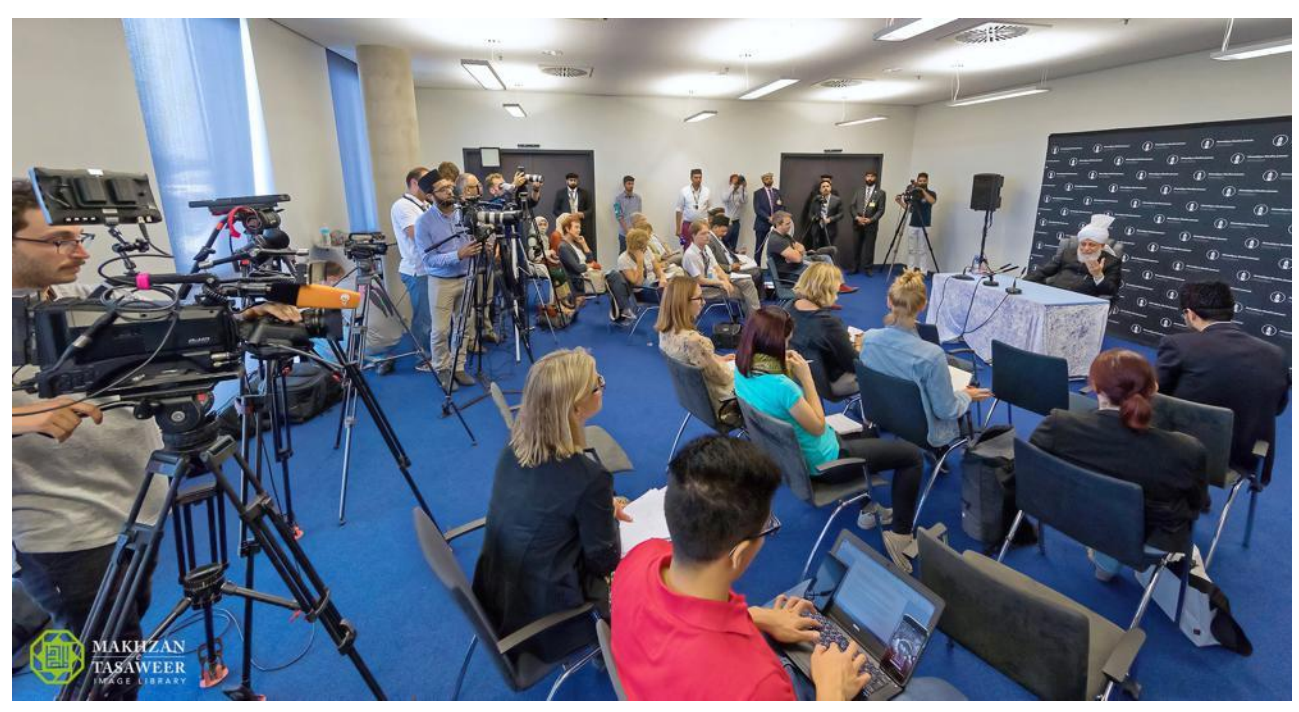
Hazrat Mirza Masroor Ahmad continued:

"It should not be the case that on the one hand, a person raises slogans in praise of the Holy Prophet (peace be upon him) but on the other hand, he or she carries out grievous injustices and atrocities in his name. Yet, tragically this is the state of the majority of Muslims today. There are so many extremist groups and also governments that are conducting heinous crimes in the name of Islam and the Holy Prophet (peace be upon him) and through their hateful actions, they are falsely exhibiting the Holy Prophet (peace be upon him) as a symbol of injustice and cruelty, whereas the truth is, and always will be, that he came as an everlasting source of mercy for mankind."