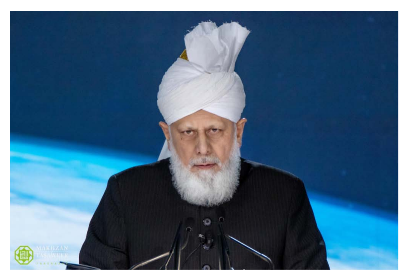
His Holiness also shone light on the true significance of 'friendship' and explained the lofty standards required to fulfil the rights of those we call our friends.