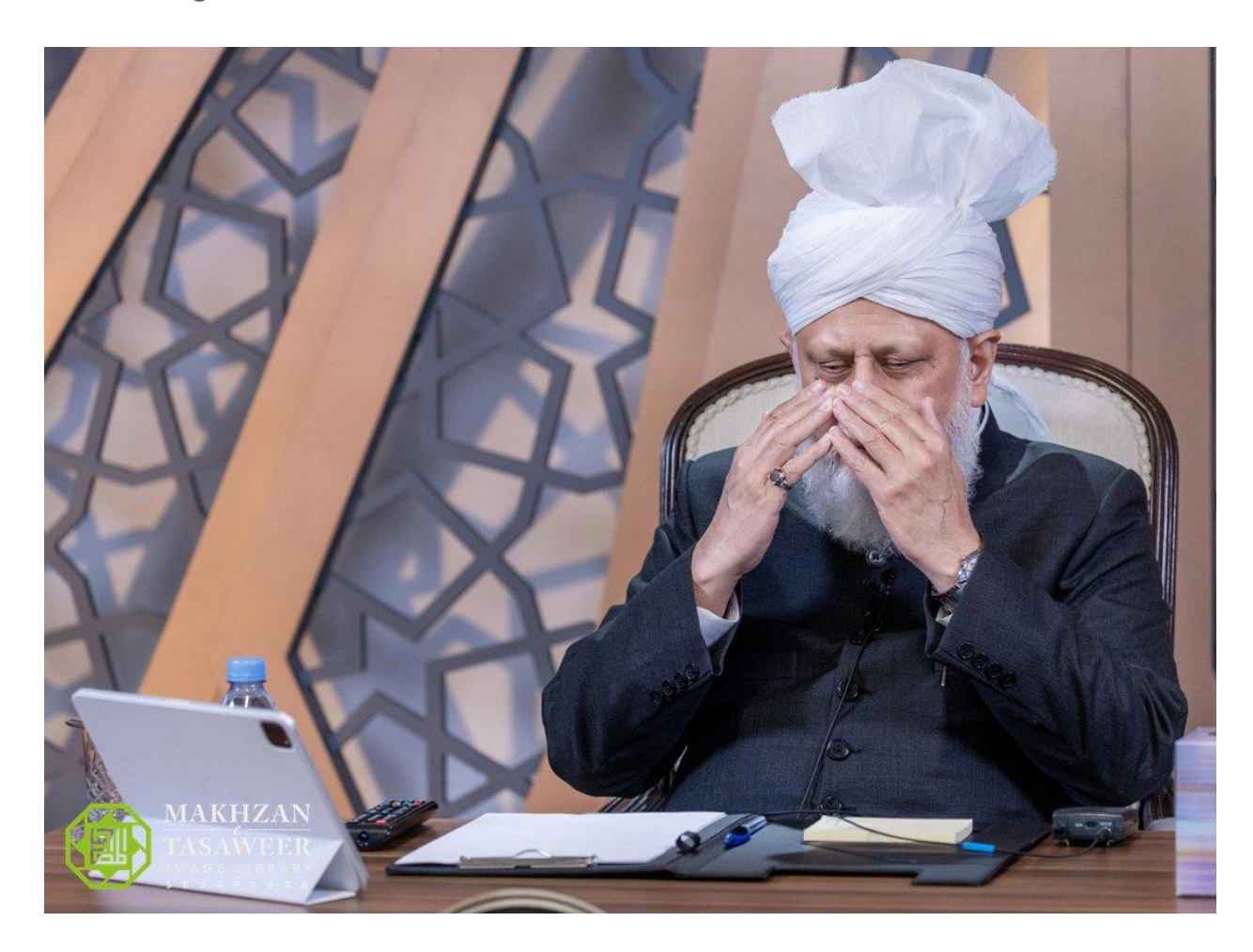
Hazrat Mirza Masroor Ahmad said:

One of the Amila members mentioned to His Holiness that there are non-Muslims who are attracted towards the spiritual teachings of Islam but are not inclined towards following its moral code of conduct. He asked if such people should be encouraged to still join Islam with the intention that later on, with time, they will work on following the moral code of conduct of Islam too.