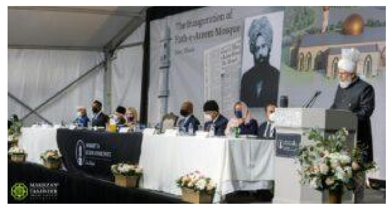
The Promised Messiah (peace be upon him) wrote:

"What can I have to do with any country? For, my country is distinct from all others.