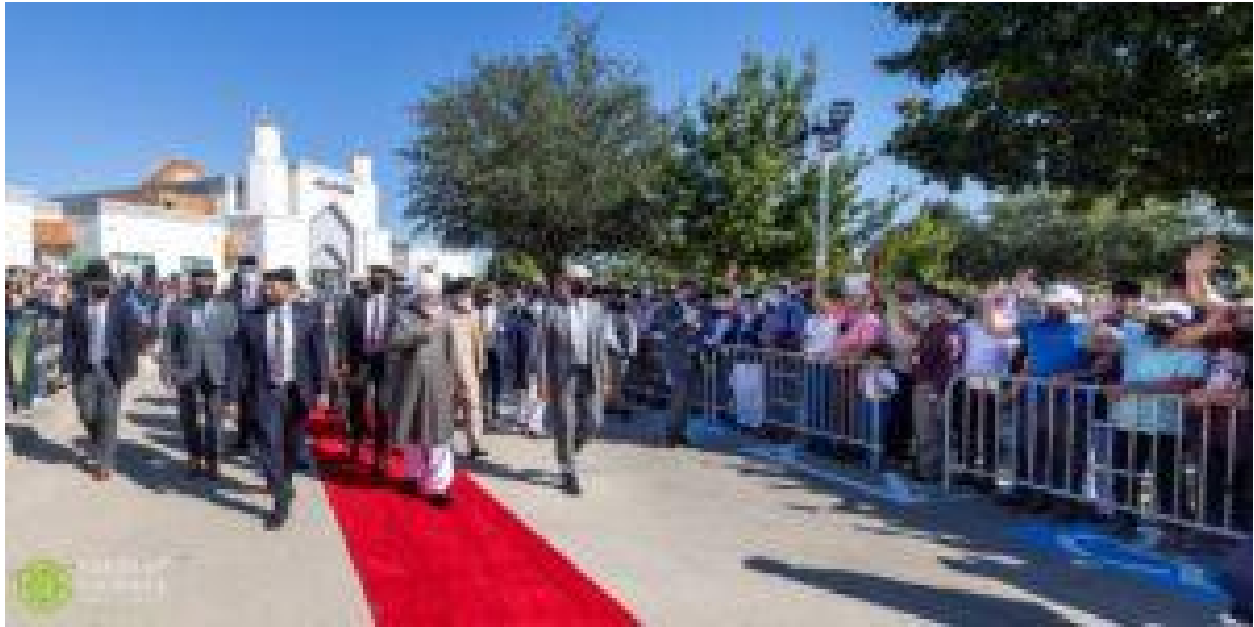
Upon arrival at the new Mosque, His Holiness was greeted by hundreds of Ahmadi Muslim men, women and children who were overjoyed at seeing their beloved Imam.