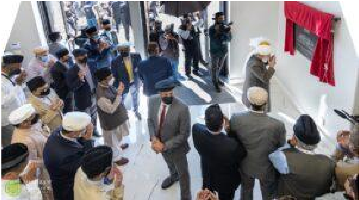
His Holiness also graced a barbeque arranged by the local Ahmadi Muslims as a means of love and encouragement.