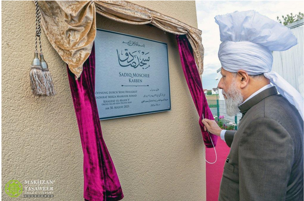
His Holiness officially inaugurated the Mosque prior to the reception by unveiling a commemorative plaque and offering a silent prayer in thanks to God Almighty. Thereafter, His Holiness led the Zuhr and Asr prayers at the Mosque and inspected the new premises.