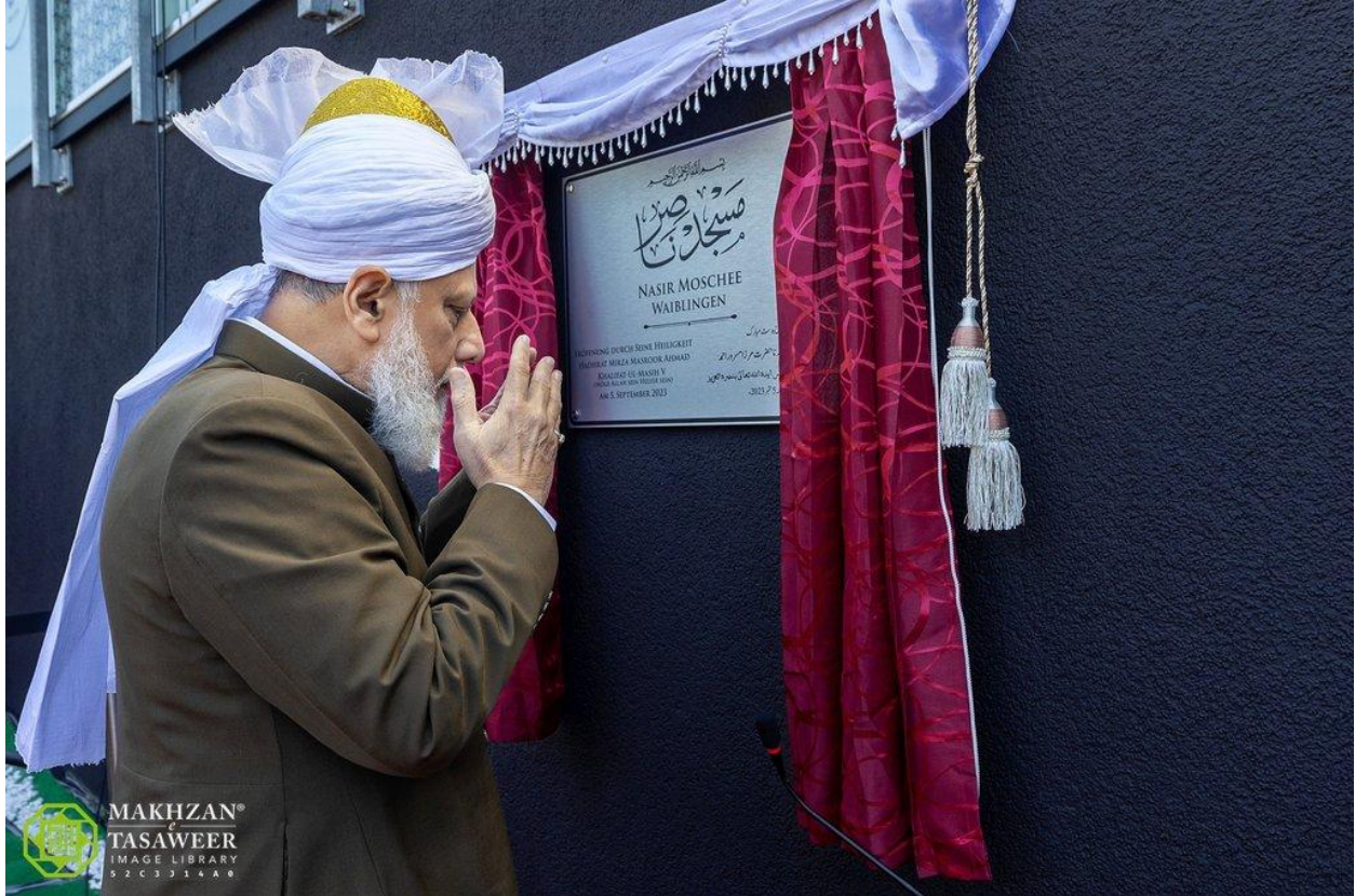
Thereafter, His Holiness led the Zuhr and Asr prayers at the Mosque and inspected the new premises before planting a tree outside the mosque.