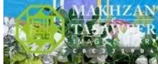
Hazrat Mirza Masroor Ahmad stated:

Lajna Imaillah & Nasirat ul Ahmadiyya UK