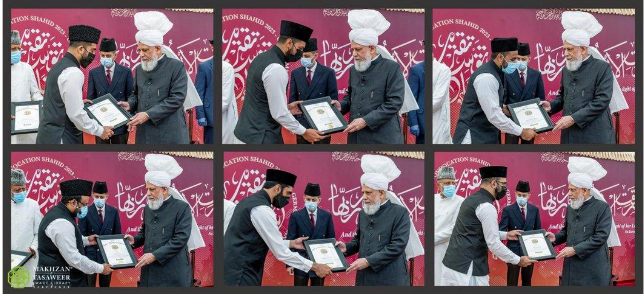
(Above: Class of 2019 Graduates (Shahideen) of Jamia Ahmadiyya Canada receiving certificates from His Holiness)

As the address concluded, His Holiness again emphasised the appropriate use of social media and said that where it is important to utilise social media for outreach work, missionaries should desist from becoming embroiled in pointless debates that have no benefit.