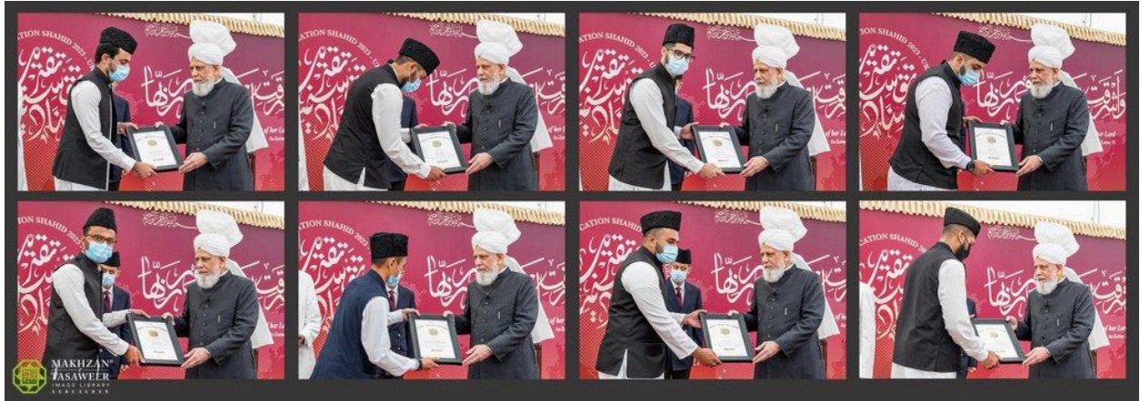
(Above: Class of 2023 Graduates (Shahideen) of Jamia Ahmadiyya Canada receiving certificates)

As His Holiness concluded his address, he emphasised that missionaries must be resourceful and find new avenues to fulfil their mission, regardless of having limited resources.