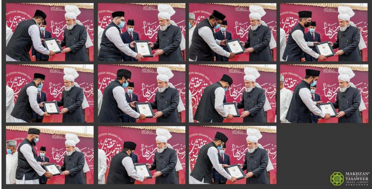
(Above: Class of 2021 Graduates (Shahideen) of Jamia Ahmadiyya Canada receiving certificates)

Reminding the missionaries about the importance of strength through unity, Hazrat Mirza Masroor Ahmad said: