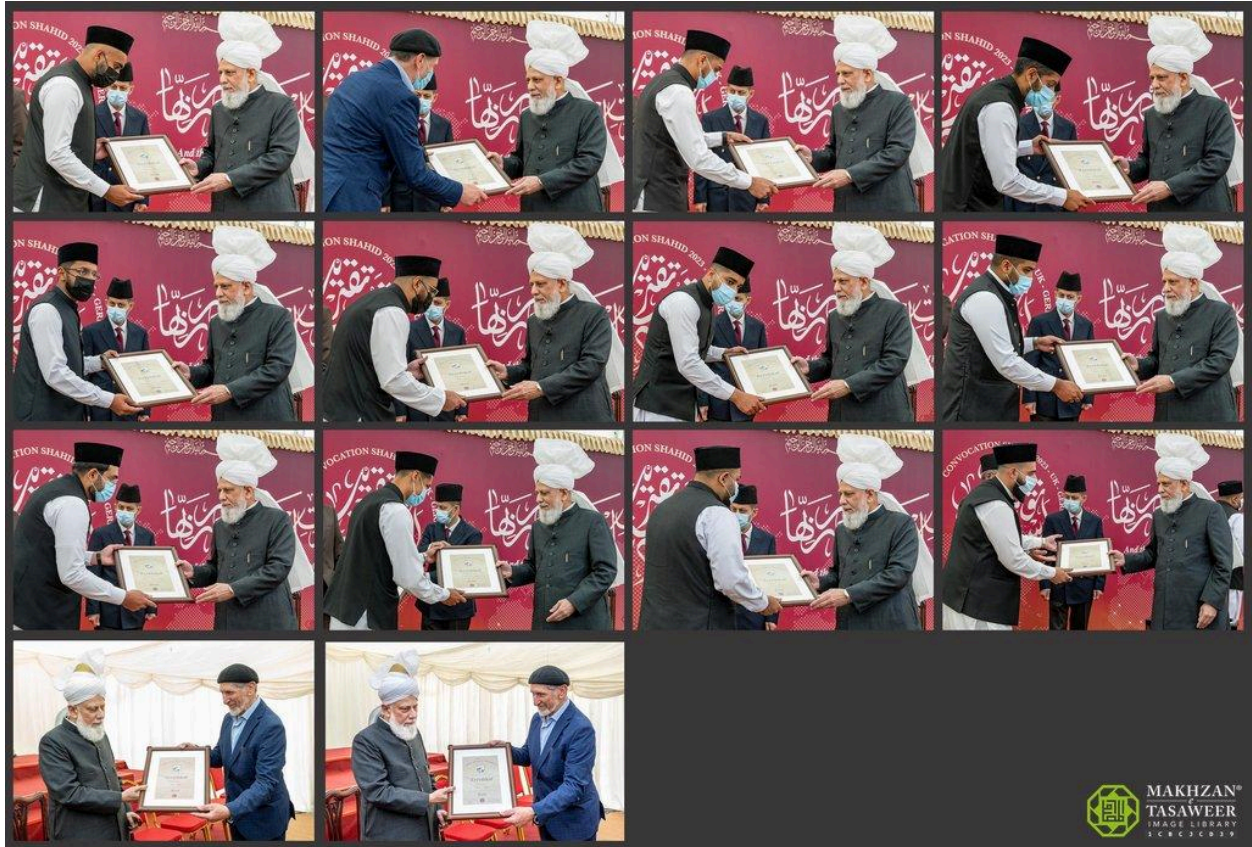
(Above: Class of 2023 Graduates (Shahideen) of Jamia Ahmadiyya Germany receiving certificates from His Holiness)

“You must have a relationship with Khilafat based on the spirit of loyalty. You are amongst the spiritual foot-soldiers of Khilafat. Missionaries say they wish to become the ‘Sultan-e-Naseer’ (devoted helpers) of Khilafat. You cannot become the Sultan-e-Naseer of Khilafat without adopting a spirit of loyalty and lofty standards of obedience. Everyone should self-analyse to see if their standard of loyalty is such that they will not harbour any lament in their hearts. Is the level of obedience such that even if they receive instructions that are against their wishes, they will obey that instruction without any complaint?”