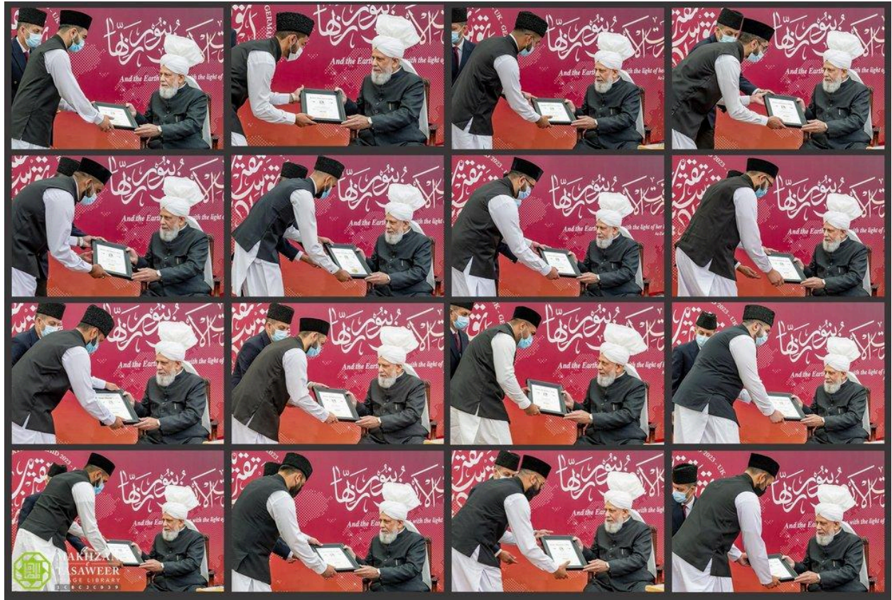
(Above: Class of 2023 Graduates (Shahideen) of Jamia Ahmadiyya UK receiving certificates from His Holiness)

Another aspect His Holiness spoke about during the address was to have a strong bond of loyalty with Khilafat.