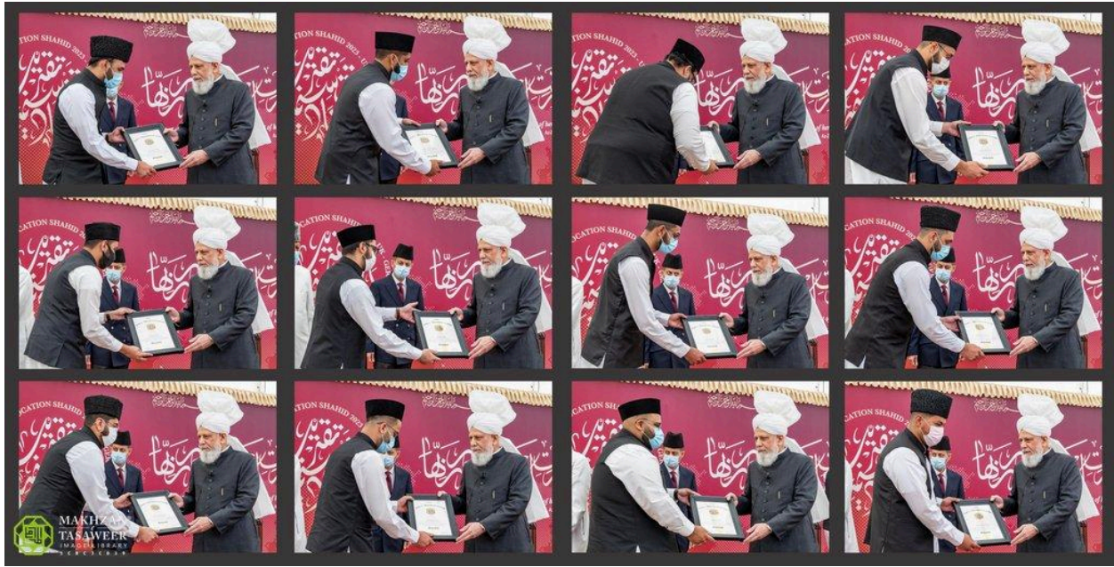
(Above: Class of 2022 Graduates (Shahideen) of Jamia Ahmadiyya Canada receiving certificates)

“Always bear in mind that unity is the sign of the success of the Community and missionaries should be at the forefront of setting their own example in this regard. They should always express their unity in such a way that it is as though they are part of one and the same body. This will have a positive impact on others too.”